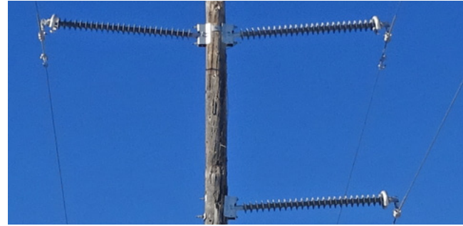
Above: An example of the new hardware.