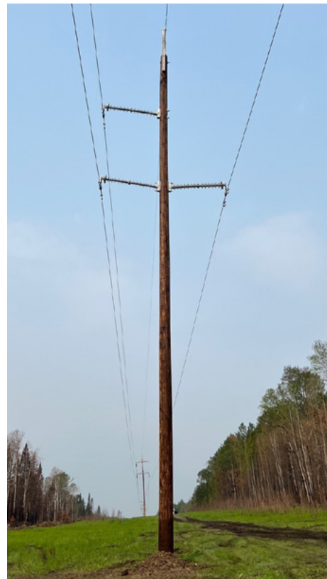
Right: An example of what the new structures will look like.