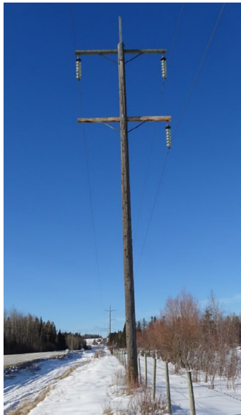
Left: An example of what the existing structures look like.

Selected structures will also be replaced with new structures that are similar in appearance. The existing structures are between 15 and 17 metres tall, and the new structures will be between 18 and 20 metres tall.